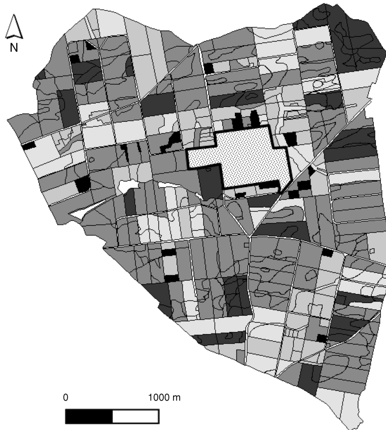
FIG. 1. Distribution of forest plots, roads and trails, and vegetation associations within the Territoire d'Etude et d'Expérimentation at Trois-Fontaines, Champagne-Ardenne, France (map year 1996). Forest plots occupied by a deer between spring and autumn during its lifetime were used to define the home range (Pettorelli et al. 2005). An example home range is presented in the center of the map (stippled polygon). Different gray scale shadings illustrate heterogeneity in forest types.

largely composed of more open forest stands containing mature trees without understory and openings of <1 ha (mature open forest; 13.4% coverage), patches of relatively young forest typically containing hornbeam ( Carpinus betulus ) and ivy ( Hedera helix ) and bramble ( Rubus spp.) understory (18.3% coverage), and dense thickets of ivy and bramble (16.4% coverage). Clearings dominated by forbs and grasses occurred as artificially constructed meadows (1.6% coverage), but also along a network of road allowances in the study area (Fig. 1). Meadows at Trois-Fontaines were created in 1973 when 10 patches of 1–3 ha each within the reserve were cleared and planted with grasses to improve food resources for roe deer. Meadows were fertilized each year from 1975 until 1982, maintained (regularly cut) but no longer fertilized through 1991, and then allowed to progressively undergo succession until the year 2000, when hurricane Lothar substantially reopened the forest (Widmer et al. 2004). We used the hurricane to mark the end of our period of study. Vegetation associations other than meadows largely remained consistent in area and structure from 1976 to 2000.