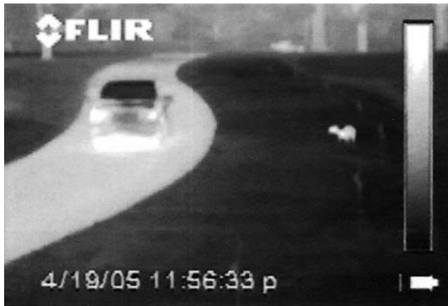
Figure 3. Deer–vehicle interaction as captured using a forward-looking infrared camera (FLIR) on 19 Apr 2005 during the amber-colored wildlife warning reflector treatment phase on Berry College Campus and Wildlife Refuge, Mount Berry, Georgia, USA.

For each deer–vehicle interaction observation, the observer selected a focal animal within the area of influence but outside of a 9-m buffer on both sides of the midline of the test area. We established this buffer to exclude animals from observation, which, because of their proximity, were most likely to be influenced by the presence of the observer. We chose focal animals to examine responses of individuals at different perpendicular and lateral distances within the area of influence and in different positions within groups of deer. We observed deer–vehicle interactions during normal traffic, which included small- to medium-sized passenger vehicles. We excluded observations, which included tractor trailers, buses, and other nonpassenger vehicles because travel by these types of vehicles was rare during the night on BCWR. When traffic was not available and deer were present in the area of influence, the observer used a 2-way radio to instruct a co-worker in a waiting vehicle to drive through the test area. We instructed the driver to maintain a continuous speed of about 48 km/hour and to use the vehicle’s high-beam headlights unless other vehicles were in the test section of road. We set these conditions to simulate a typical vehicle traveling on BCWR (J. Baggett, Berry College Police Department, personal communication).